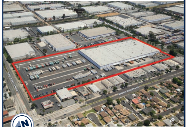
Building 114 located within red border